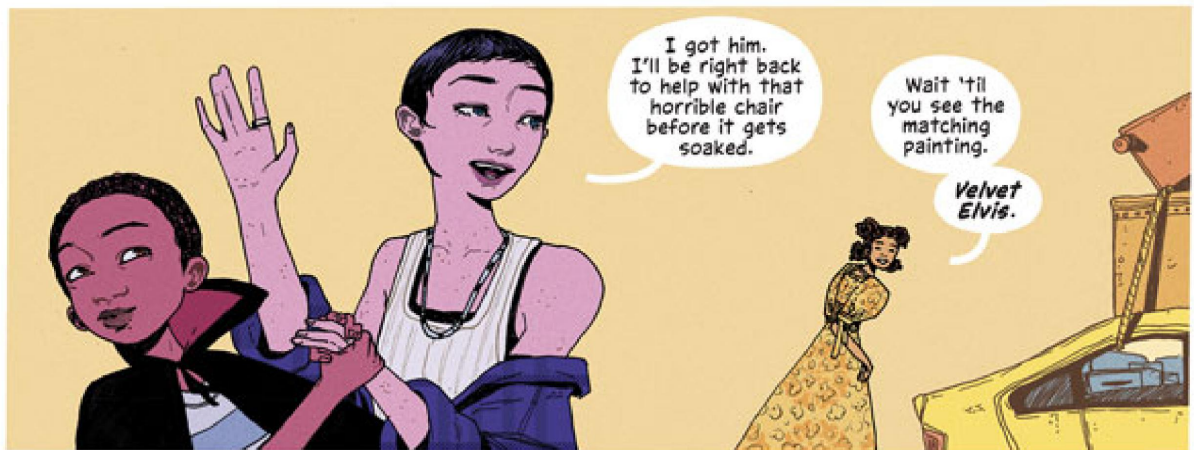
Ursula Blake. Templeton's mother. A widow ever since Temp's father got drunk and drove himself into Sunshine Canyon. And one of the few survivors the day it rained on Jackdaw Street.

I got him. I'll be right back to help with that horrible chair before it gets soaked.